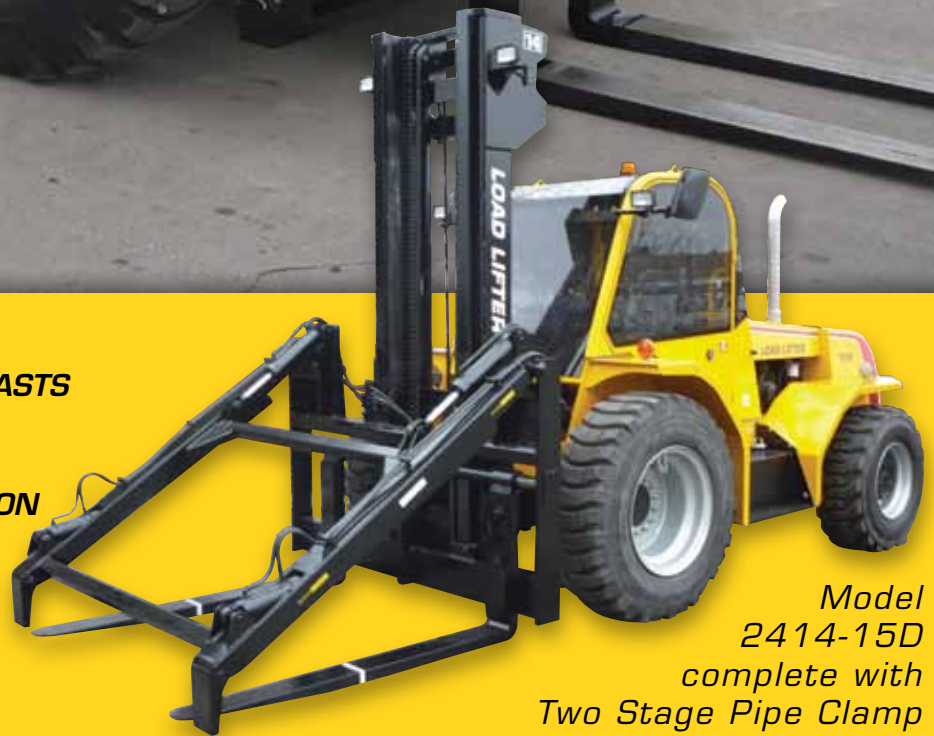
Model 2414-15D complete with Two Stage Pipe Clamp